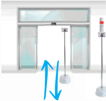
Single door access